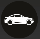
Car SUV MPV 4WD