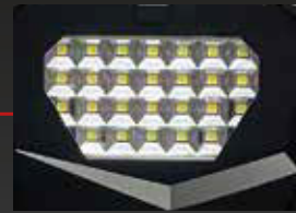
Led light on rear