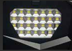
Led light on rear